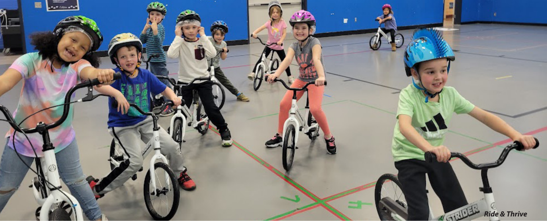
Ride & Thrive