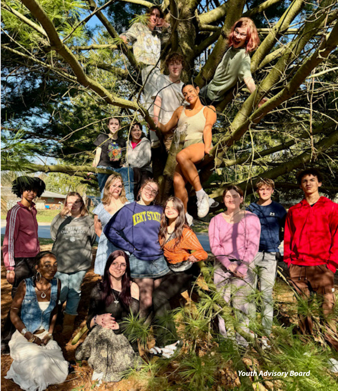
Youth Advisory Board