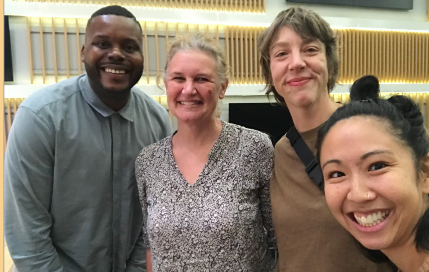
Mayor Tubbs and YSCF

Q: What's the solution to poverty? A: Money